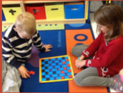
Classroom supplies cont'd...